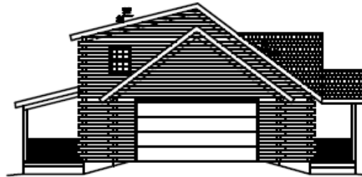
RIGHT SIDE ELEVATION 1/8" = 1'-0"