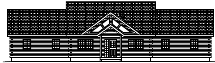
FRONT ELEVATION 1/8" = 1'-0"